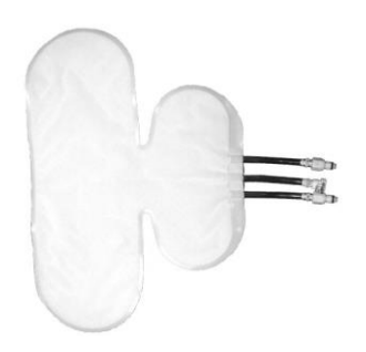
Wrap, Large Butterfly, SPU