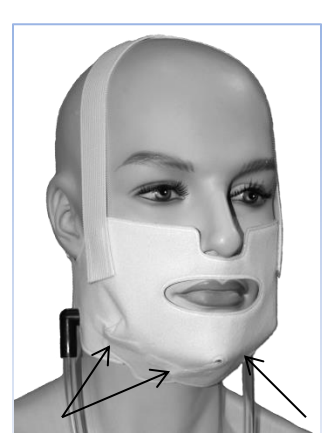
Figure 3 – Apply to jaw and secure w/tabs