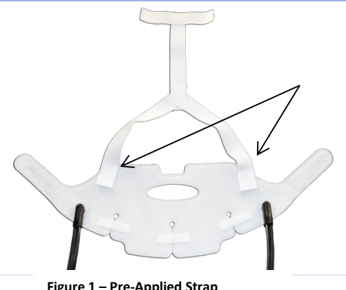
Figure 1 – Pre-Applied Strap