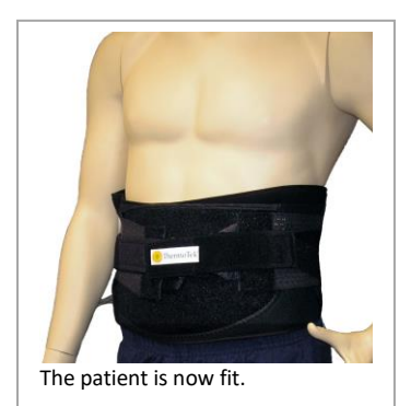
panel as shown.