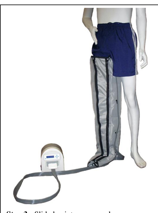
Step 3: Slide leg into wrap as shown.