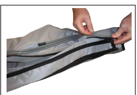
Step 2: Zip the remaining zipper edge of the extender to the lymphedema wrap.