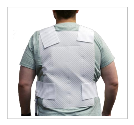
Umbilical hose connection

Re-Order Part Number: 0P9BTSVESTMR3 (Non-Sterile)