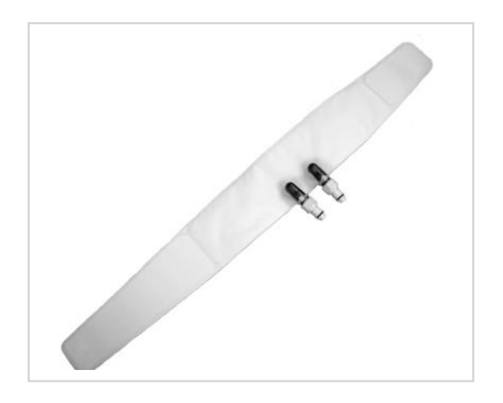
Wrap, Upper Cervical, SPU