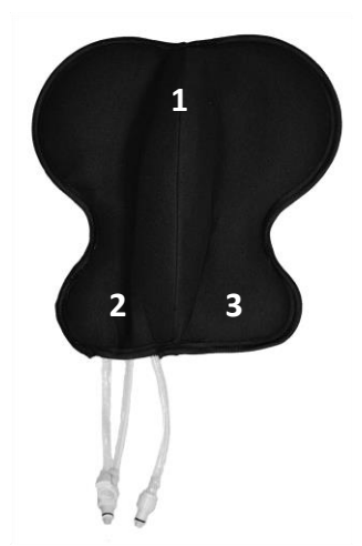
Therapy wrap: Application instructions for RIGHT shoulder application.