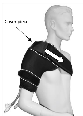
Step 4: Pull the torso strap tight to secure. Apply cover pieces to exposed hook and loop on torso strap.