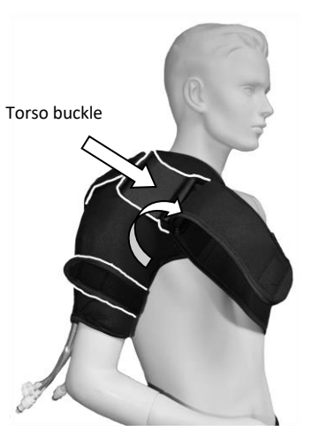
Step 3: Pull the opposite end of the torso strap up and around the torso. Feed the end of the torso strap through the torso buckle. Attach the buckle to the therapy wrap.