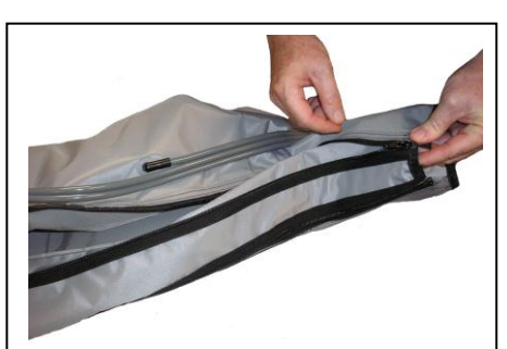
Step 2: Zip the remaining zipper edge of the extender to the lymphedema wrap.