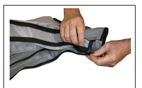
Step 1: Open up lymphedema wrap and zip one zipper edge of the extender to the wrap.