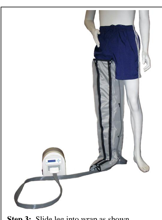
Step 3: Slide leg into wrap as shown.